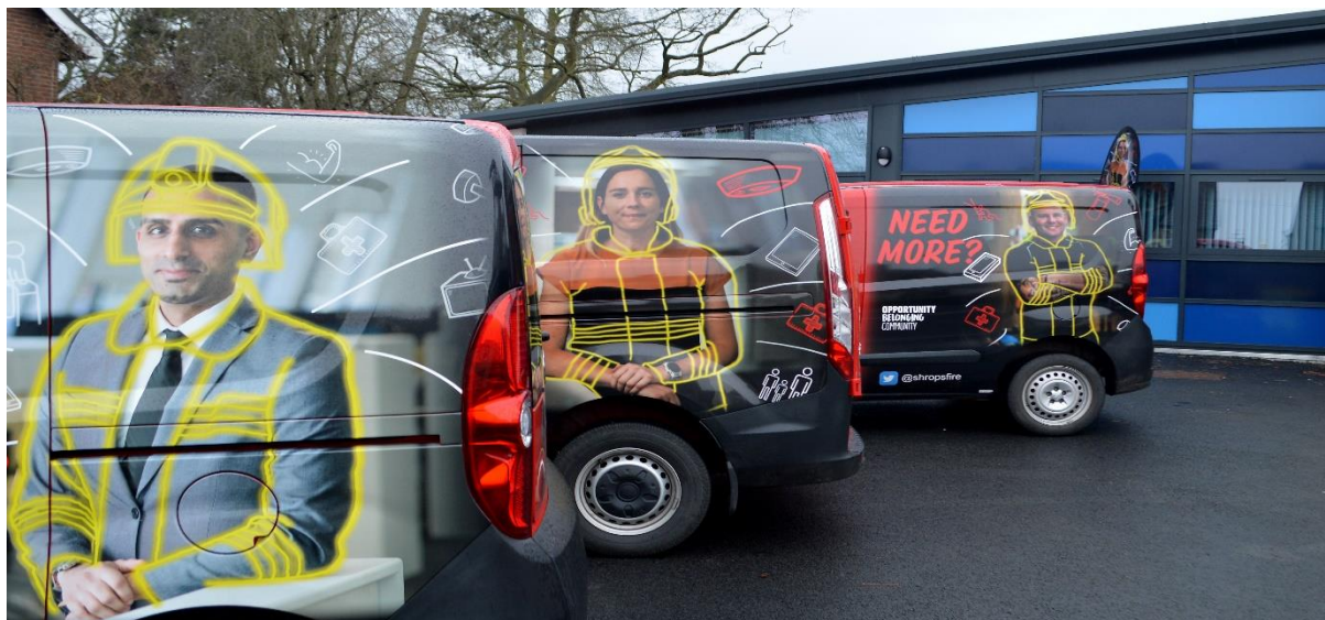
GST vehicles at a recruitment event in Much Wenlock

The On Call Sustainability project will begin shortly with a number of On Call 'champions' volunteering to help shape the research. A 12-month Watch Manager post has also been agreed to assist with this project. The service has delayed the implementation of this during the Covid-19 outbreak to ensure value for money in this secondment.